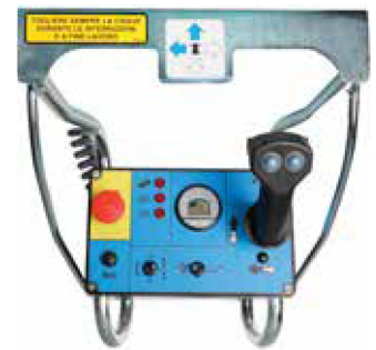
Sturdy, simple and intuitive control box on platform