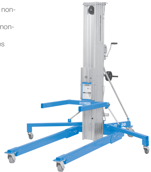
(1) Available aftermarket only